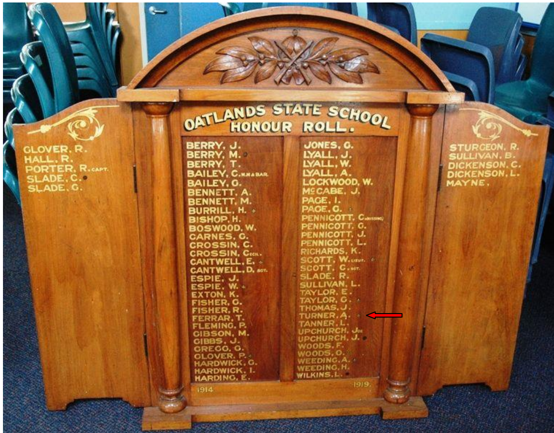
Oatlands State School Honour Roll

A. Turner is remembered on the Oatlands State School Honour Roll located at Oatlands District High School, Church Street, Oatlands, Tasmania.