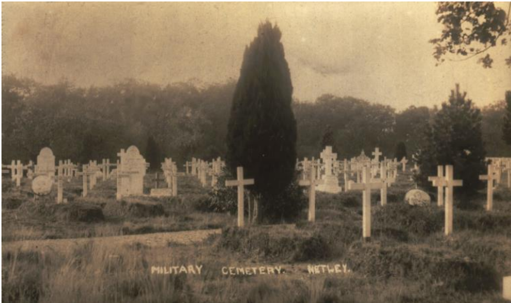
Original Cross markers – Netley Military Cemetery