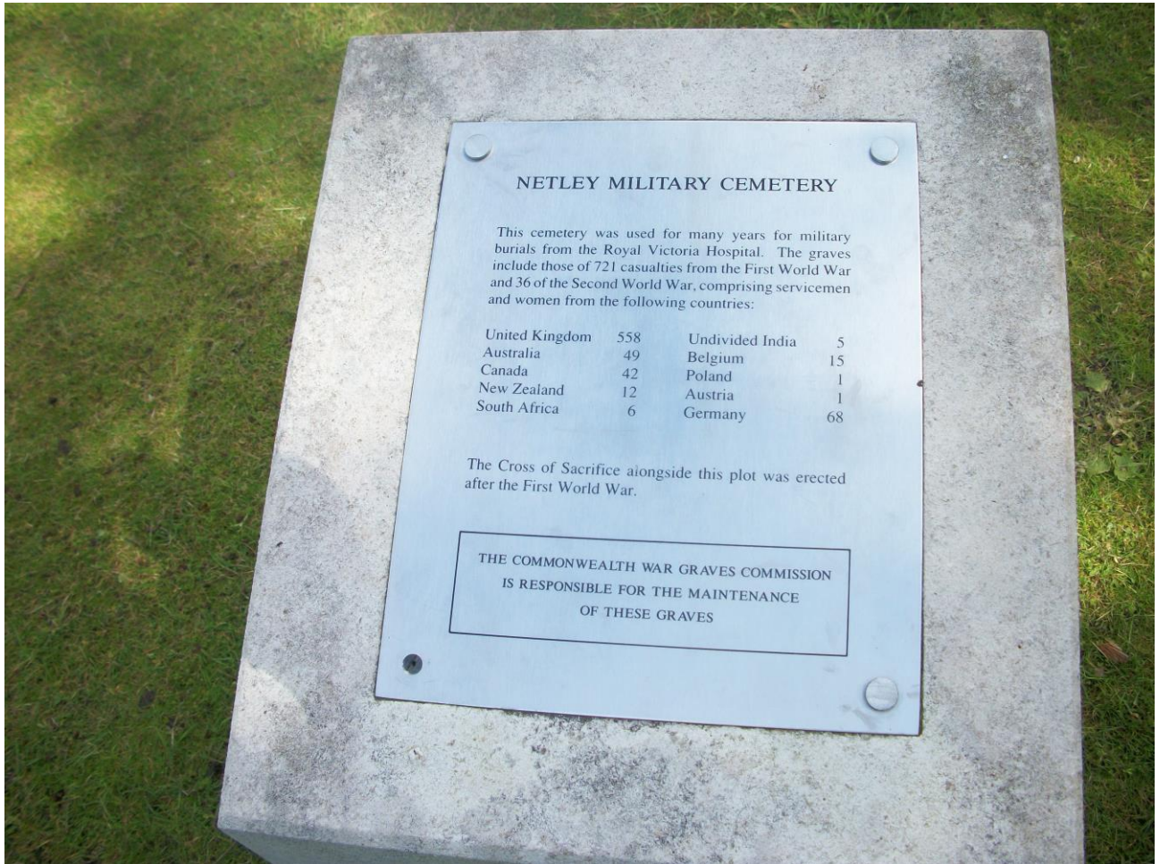
Netley Military Cemetery, Hampshire