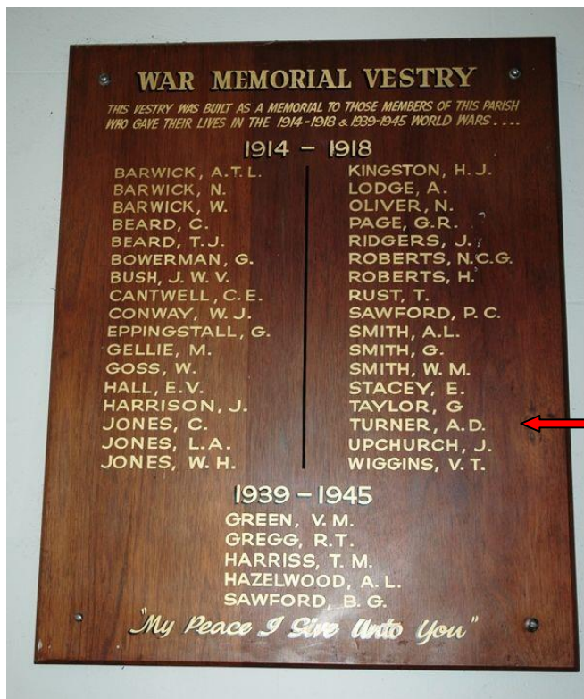
St Peter's Church Memorial Vestry